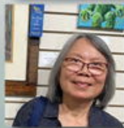
First Place "On Route Basel Cathedral" Shenn - Yi Lo