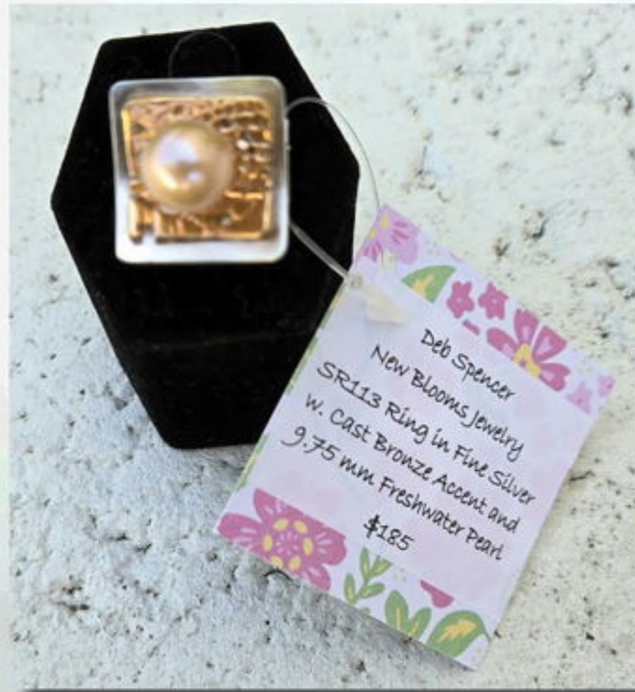
First Place "Freshwater Pearl Ring with cast Bronze Accent" Deb Spencer