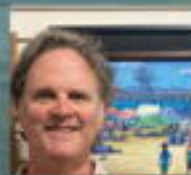
Honorable Mention "View Of San Onofre Beach" John Dillon