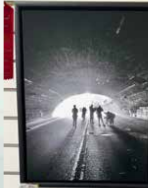
Second Place "Tunnel Vision" Todd Metzger