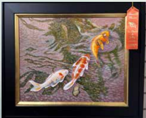
Honorable Mention "The Koi Pond" Yen Shen Shen (Not present)