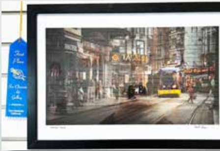
First Place "Istanbul" Brad Friesen (Not present)